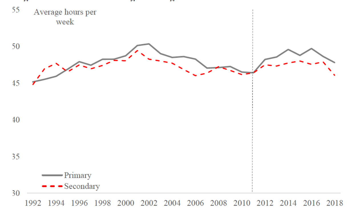
Figure 5. Trends in the average working hours of teachers between 1992 and 2018