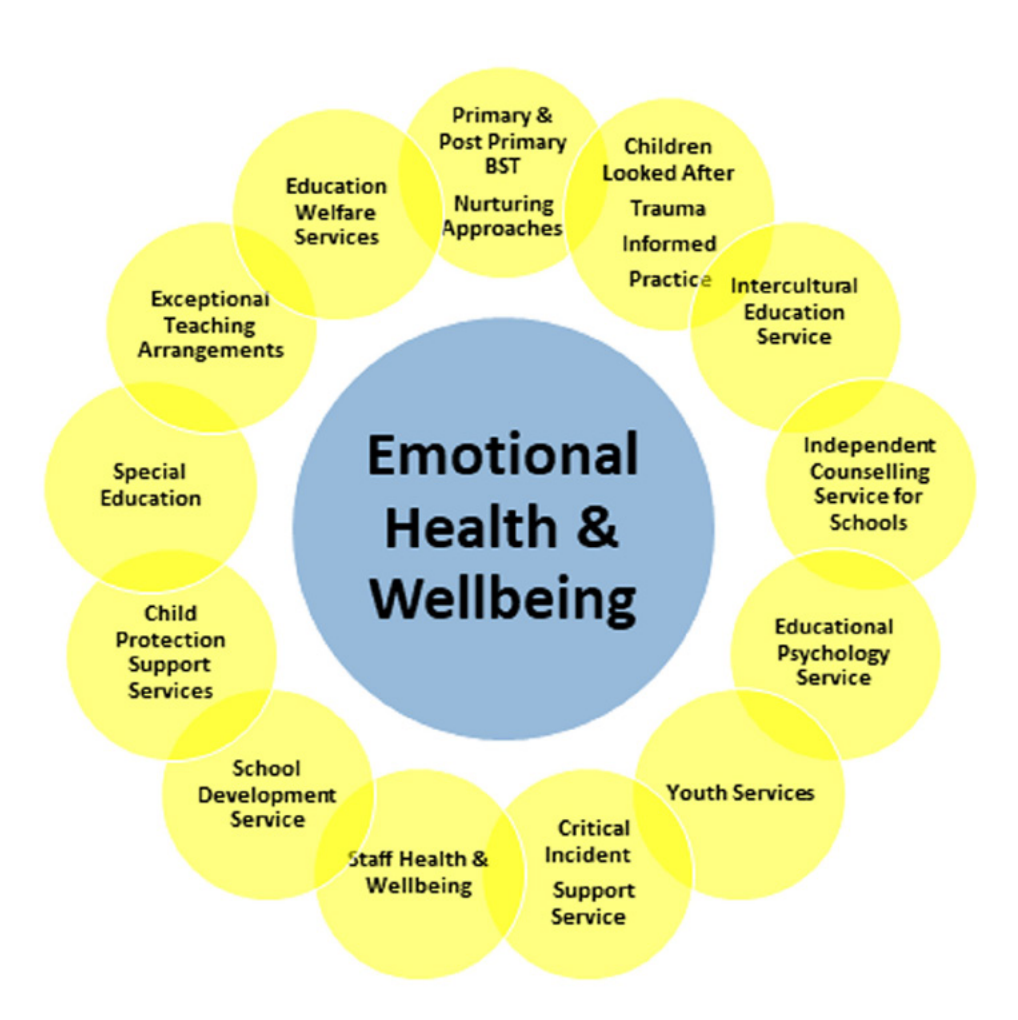
Figure 2: A Co-ordinated EA approach in supporting children and young people

2.1 The Education Authority provides support for schools through a range of services as demonstrated below: